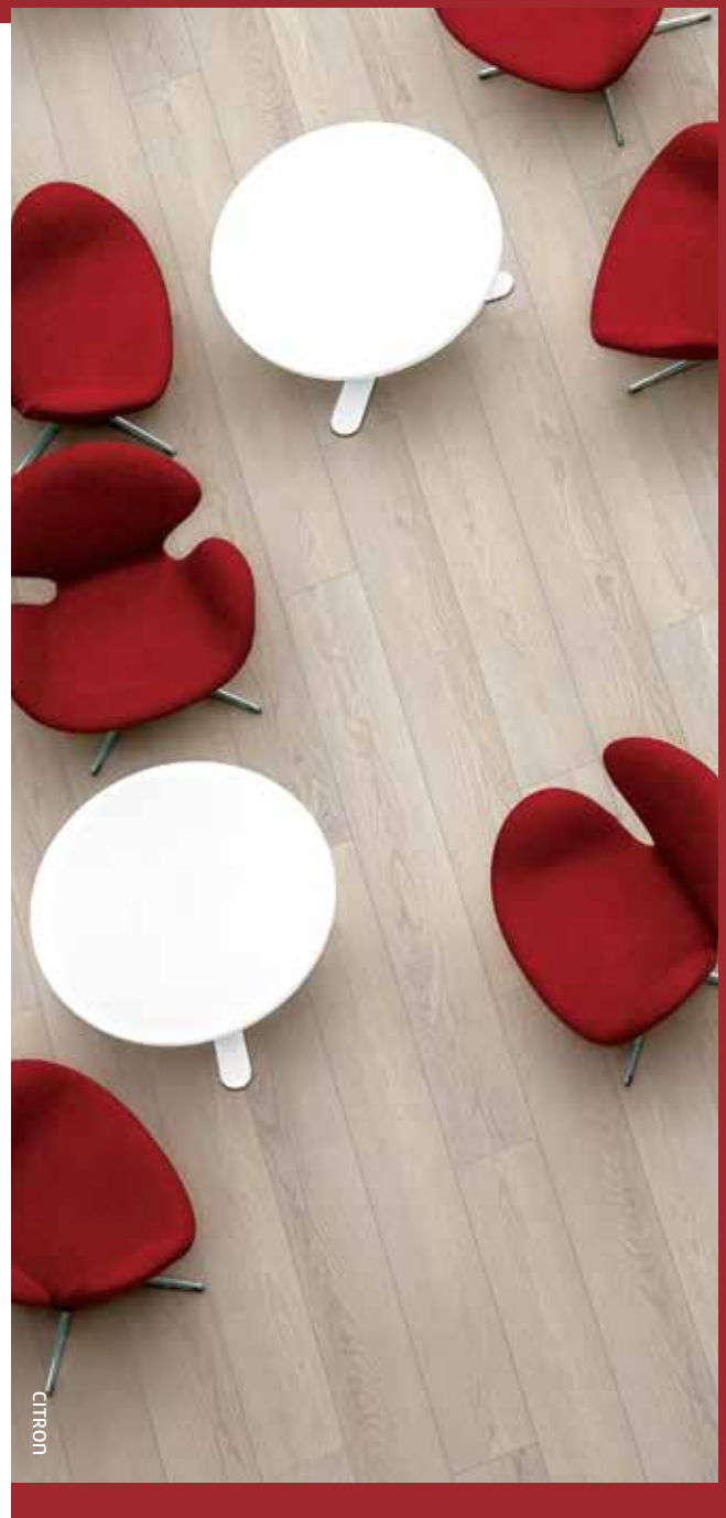
MAXimize Your Impact!