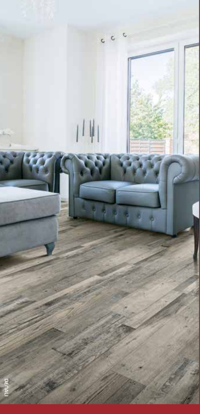
The Pinnacle of Style and Performance!